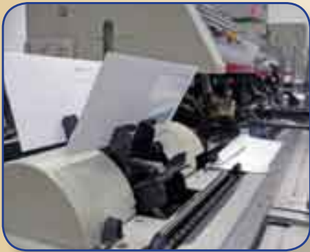
Bell & Howell MailStar 500