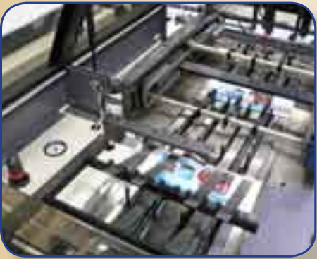
Pitney Bowes FlowmasterFX