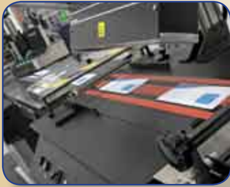
Videjet G4100 Wide Array